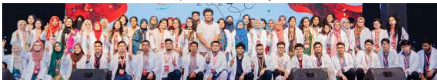
Group Photo : English Version and English Medium Students