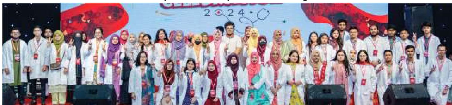
Group Photo : Dinajpur Medical College