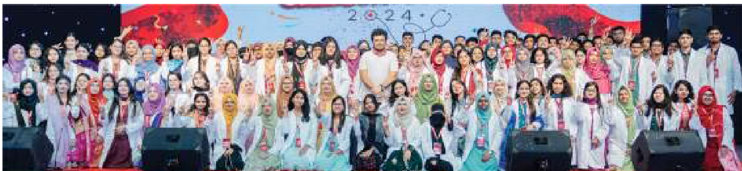
Group Photo : Shaheed Tajuddin Ahmad Medical College | Tangail Medical College | Jamalpur Medical College | Manikganj Medical College