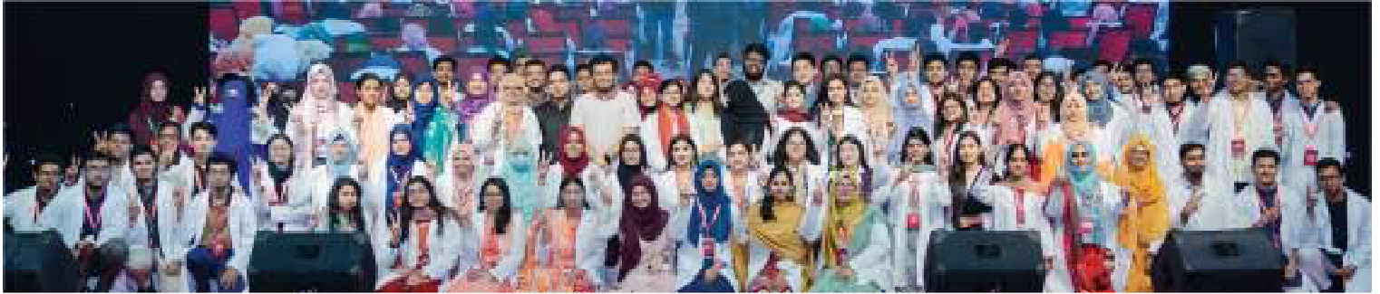
Group Photo : Dhaka Medical College

Reception for those who got a chance in Government Medical and Dental College in the 2024 batch