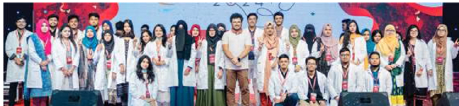
Group Photo : Shaheed Ziaur Rahman Medical College, Bogura