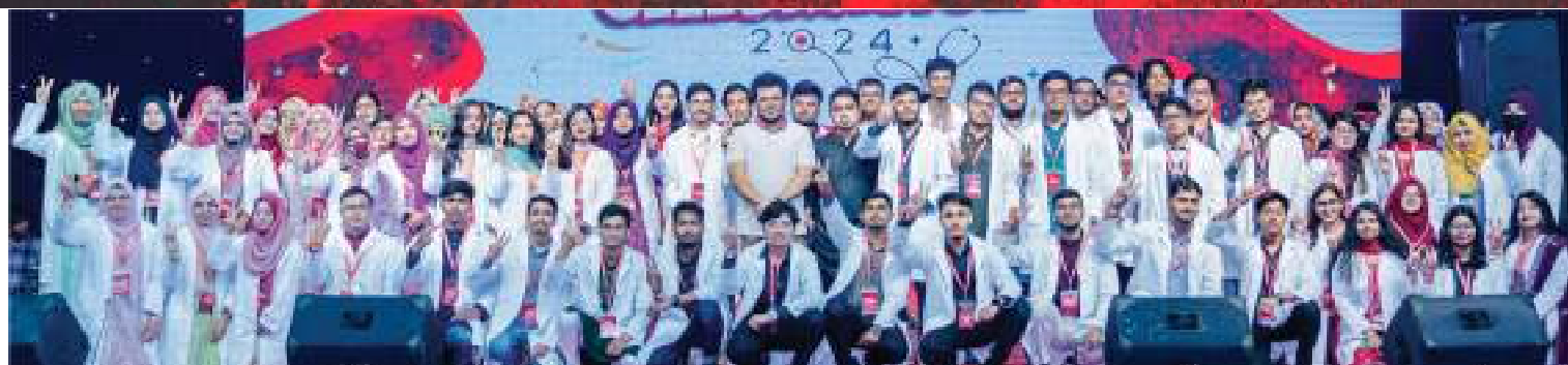
Group Photo : Rajshahi Medical College