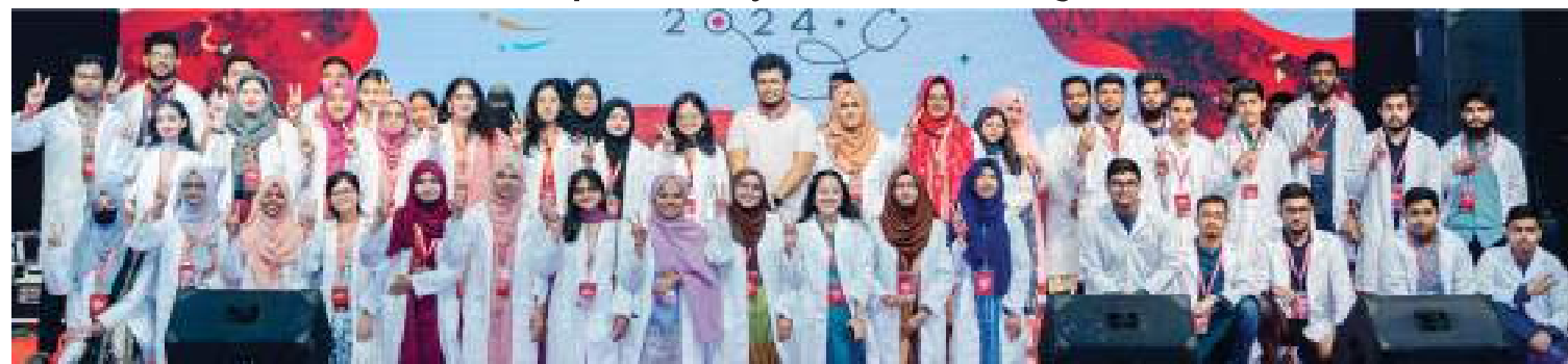
Group Photo : Sylhet M.A.G. Osmani Medical College