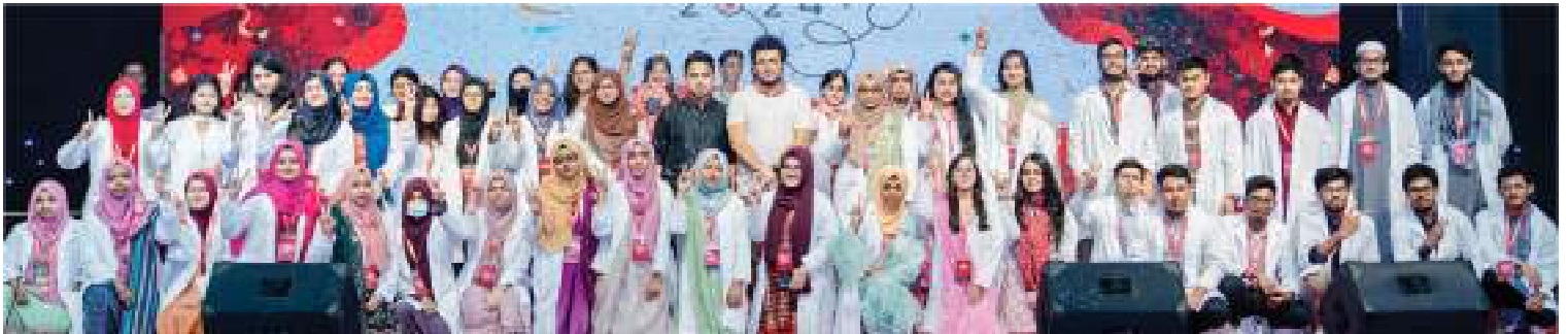
Group Photo : Chattogram Medical College