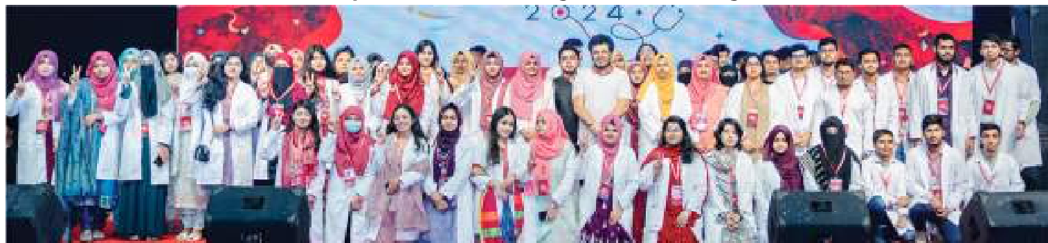
Group Photo : Rangpur Medical College