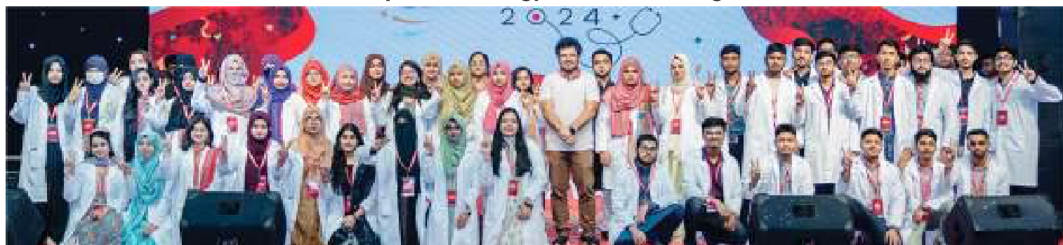
Group Photo : Cumilla Medical College