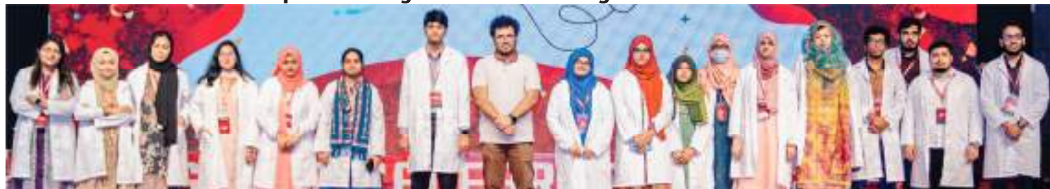
Group Photo : Armed Forces Medical College | Army Medical College