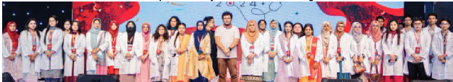
Group Photo : Adamjee Cantonment College