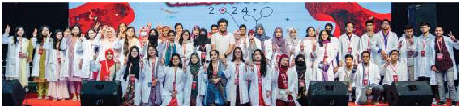
Group Photo : Mugda Medical College | Habiganj Medical College | Netrokona Medical College | Nilphamari Medical College