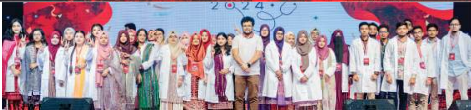
Group Photo : Noakhali Medical College | Cox's Bazar Medical College | Jashore Medical College