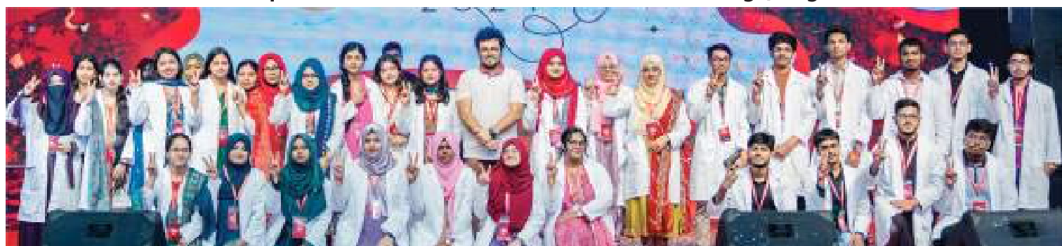
Group Photo : Faridpur Medical College