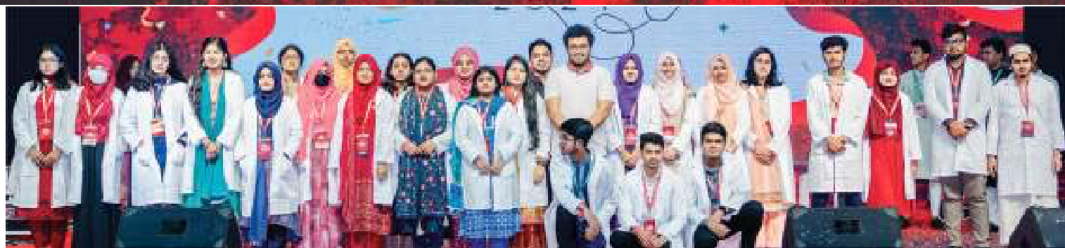
Group Photo : Khulna Medical College