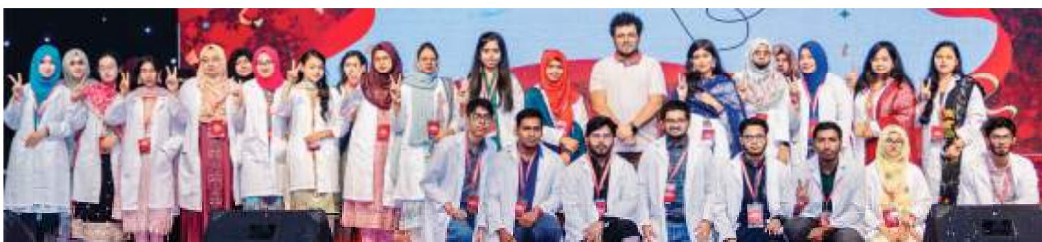
Group Photo : Magura Medical College | Naogaon Medical College | Chandpur Medical College | Sunamganj Medical College