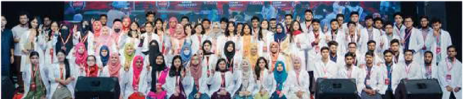
Group Photo : Shaheed Suhrawardy Medical College