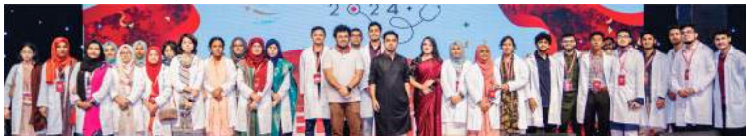
Group Photo : Cadet Colleges