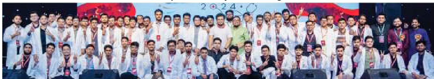
Group Photo : Notre Dame College, Dhaka