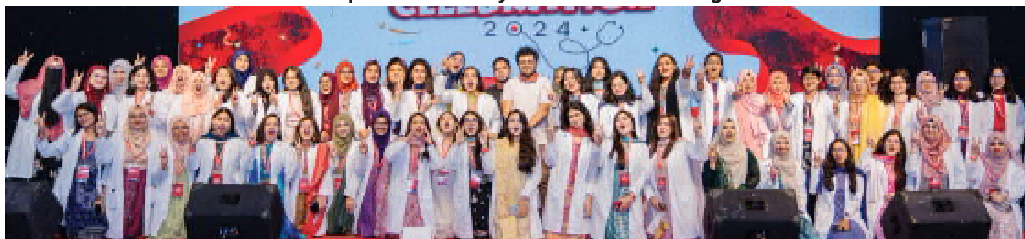
Group Photo : Viqarunnisa Noon School & College