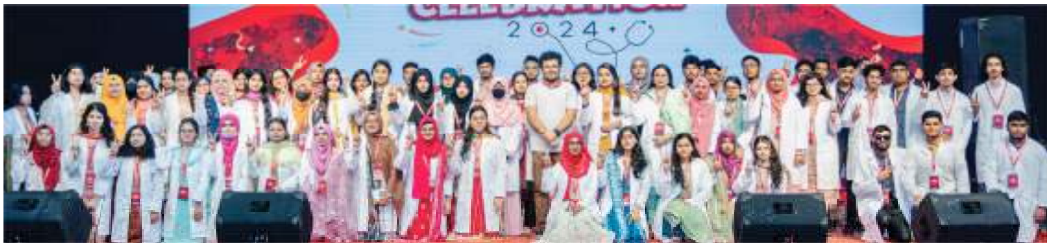
Group Photo : Satkhira Medical College | Shahid Syed Nazrul Islam Medical College, Kishoreganj | Kushtia Medical College | Gopalganj Medical College