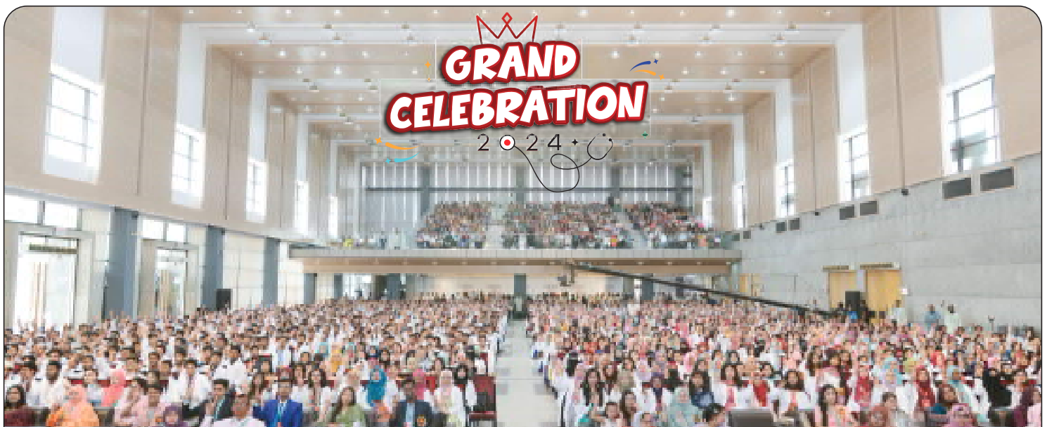
Students from various branches of Medico who secured admission to government medical and dental colleges in 2024–25 academic session.

Follow MEDICO's official Facebook page to stay updated!