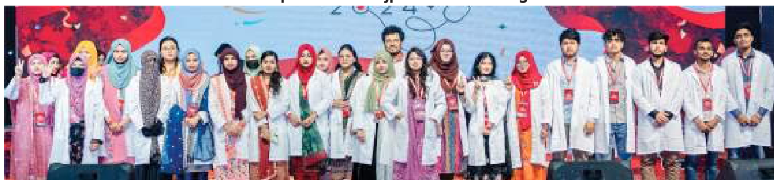
Group Photo : Pabna Medical College