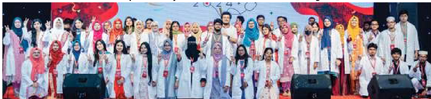
Group Photo : Sher-E-Bangla Medical College