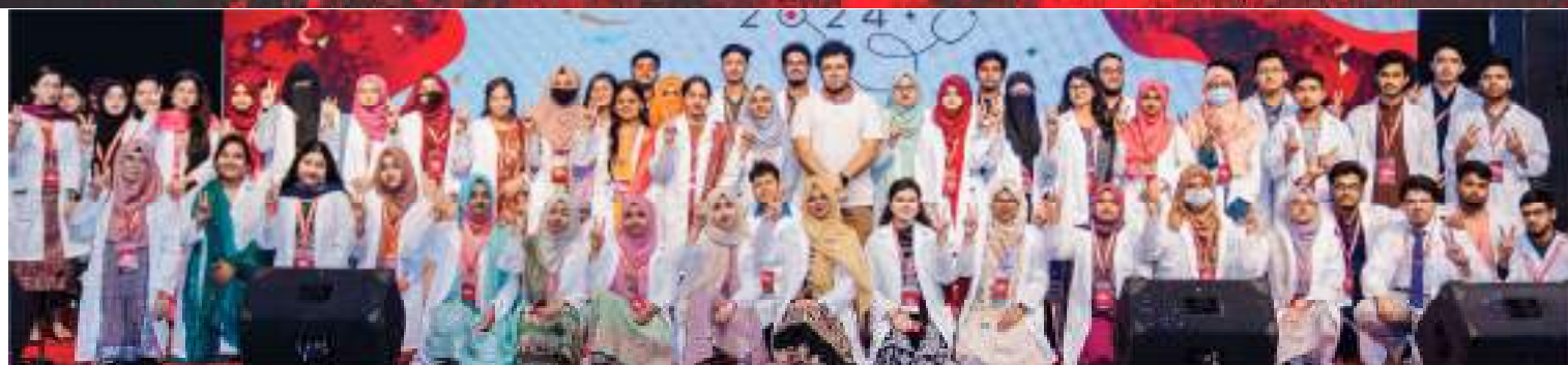
Group Photo : Dhaka Dental College and other Dental college units