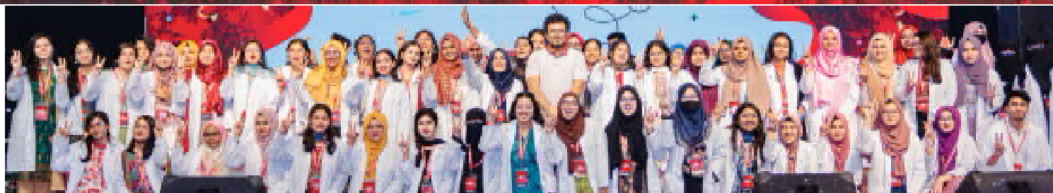
Group Photo : Rajuk Uttara Model College