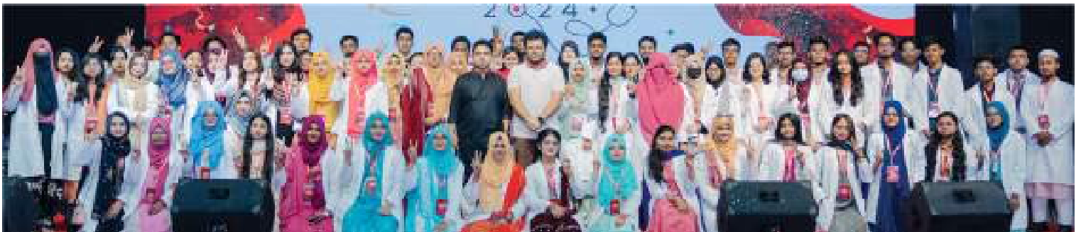
Group Photo : Mymensingh Medical College