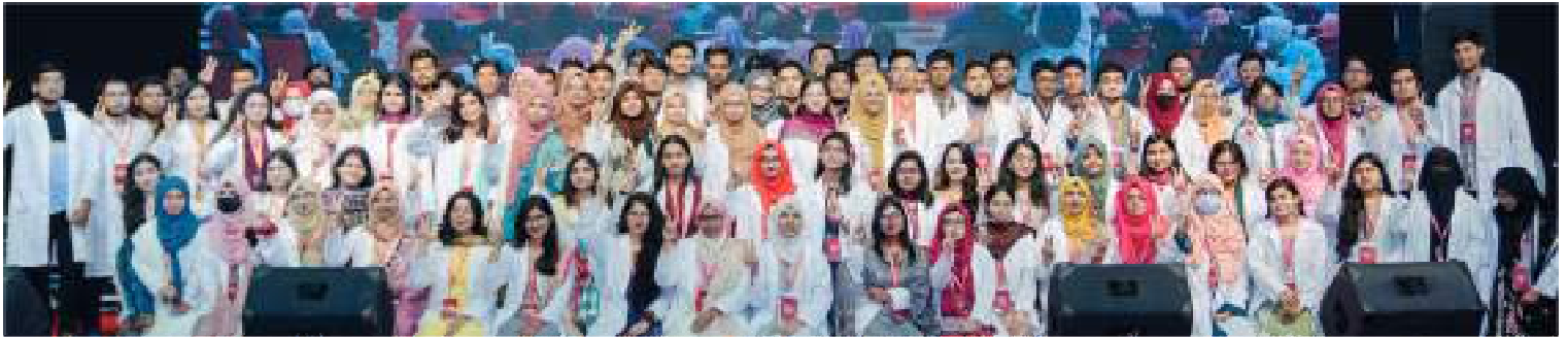
Group Photo : Sir Salimullah Medical College