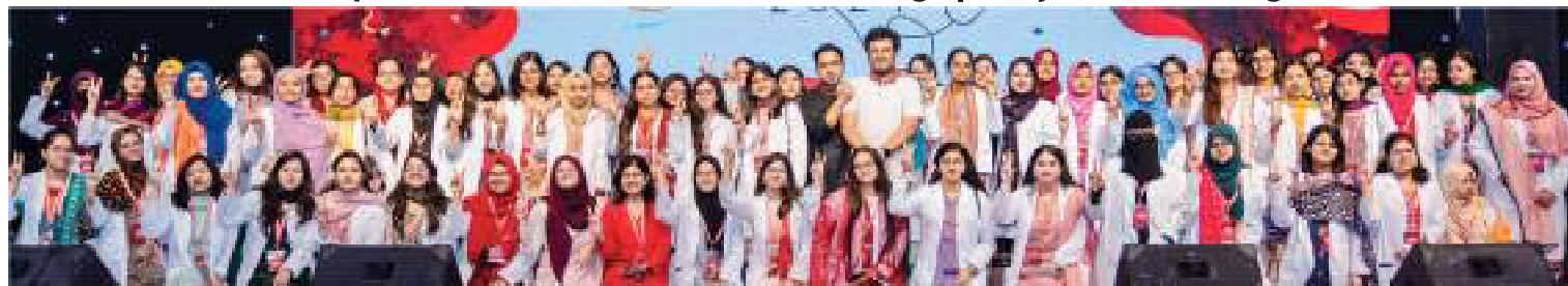
Group Photo : Holy Cross College